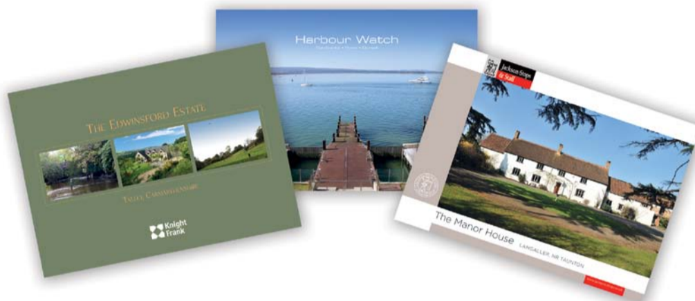
ESTATE AGENTS' BROCHURES

Our proven expertise in providing this link with consistency is the reason why we at Kingfisher have been entrusted to serve some of the UK's most prestigious estate agents.